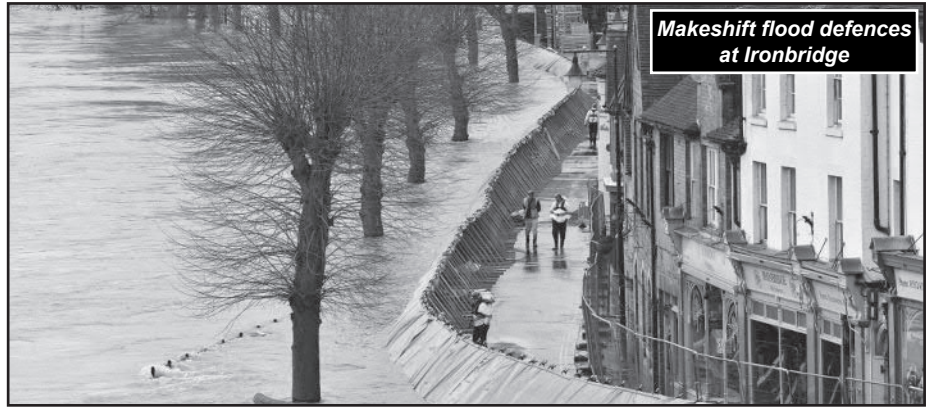
Makeshift flood defences at Ironbridge

Environment Secretary, George Eustice, and PM Johnson (when he could be found!) told journalists repeatedly what huge sums of money (billions!) the government had pumped into "flood defences" - without specifying exactly when or where - thus "protecting" thousands of homes which would otherwise have been flooded. In other words, their answer to the many flood victims was, "trust us, it could have been so much worse!" But if they were so "up to speed", why did they avoid visiting affected communities? Eustice claimed it wasn't necessary, since "we've had a