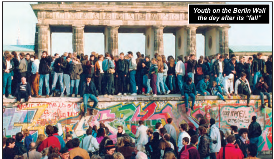
Youth on the Berlin Wall the day after its "fall"

in the East European satellite countries, among the privileged layers of the regimes - which had never been "communist" except in the Cold War propaganda of the imperialist powers. They rushed to grab the new privileges opened up by the establishment of the market economy and their countries' reintegration into the world capitalist market. At the same time these forces reverberated within the Soviet Union itself, leading to its break-up in an orgy of nationalism.